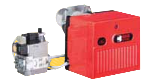
Gas Fired Burner