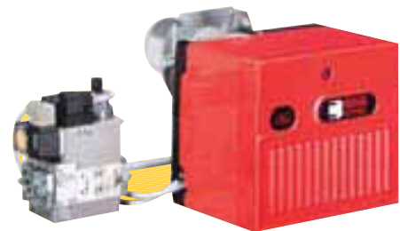
Gas Fired Burner