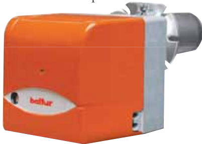
Oil Fired Burner