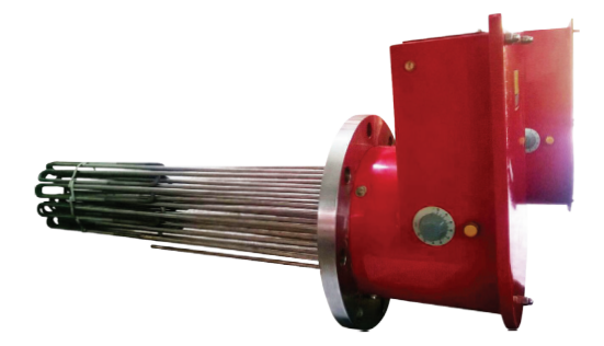
Flanged Type Immersion Heaters

Although electricity is associated with high running costs, it is also a very efficient means of heating domestic hot water due to all the power used being converted into heat. Primary LTHW &steam boilers can be as inefficient as 85% of the power used to heat the medium. Utilizing electricity also negates the need for extra space within the plant room to cover the duty boilers that need to be installed for heating applications can be smaller, thus freeing space for other applications.